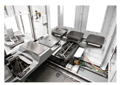
Pallet changer PW 850 with storage